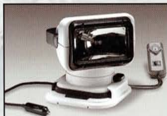
SMGOL-01 Magnetic Mount Golight™ with wired remote

*Components of kit depend on model of plow.